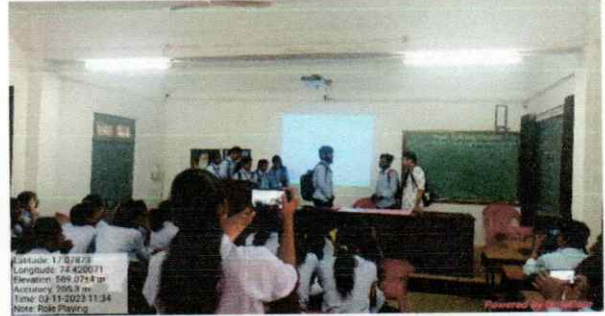
Latitude: 17.07873 Longitude: 74.420071 Elevation: 589.0719 m Accuracy: 595.8 m Time: 04-11-2023 11:34 Note: Role Playing