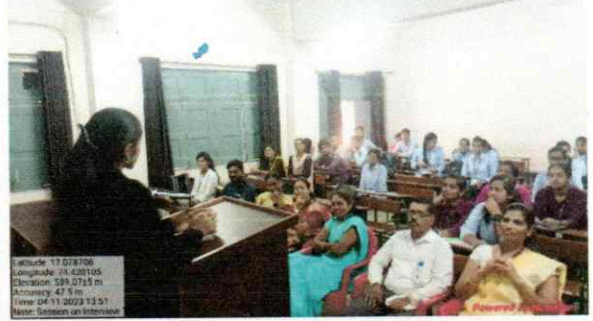
Latitude: 17.078706 Longitude: 74.420195 Elevation: 589.0715 m Accuracy: 47.5 m Time: 04-11-2023 11:51 Note: Session on Interview