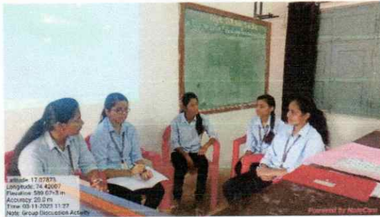
Latitude: 17.07871 Longitude: 74.42007 Elevation: 589.0719 m Accuracy: 20.0 m Time: 04-11-2023 11:23 Note: Group Discussion Activity