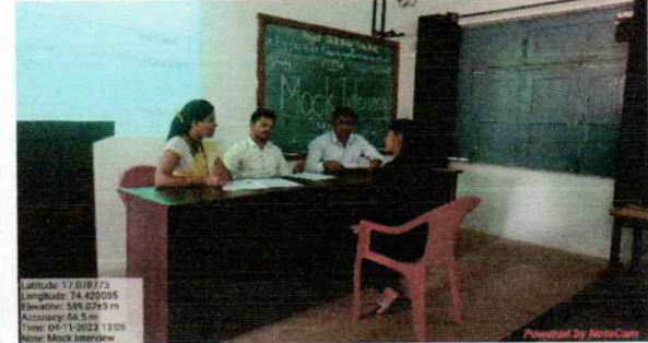
Latitude: 17.078773 Longitude: 74.420095 Elevation: 589.0713 m Accuracy: 66.8 m Time: 04-11-2023 11:05 Note: Mock Interview