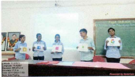
Latitude: 17.07872 Longitude: 74.42009 Elevation: 589.0746 m Accuracy: 27.5 m Time: 04-11-2023 11:43 Note: Role Playing