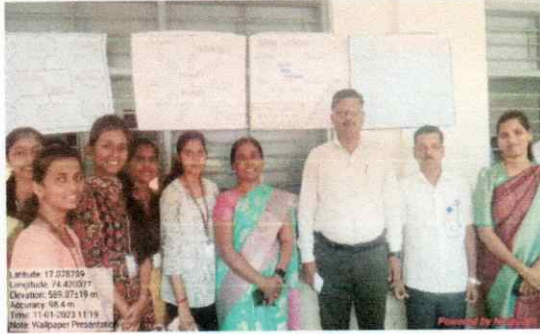
Latitude: 17.07899 Longitude: 74.42007 Elevation: 589.0719 m Accuracy: 18.4 m Time: 04-11-2023 11:19 Note: Wallpaper Presentation